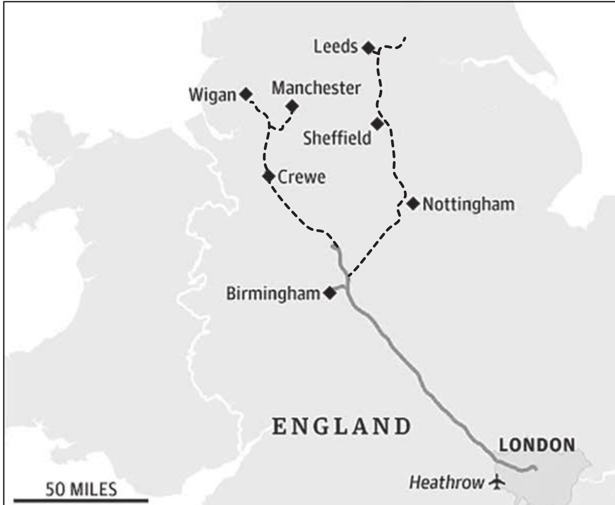
Figure 1 The HS2 route in England, UK