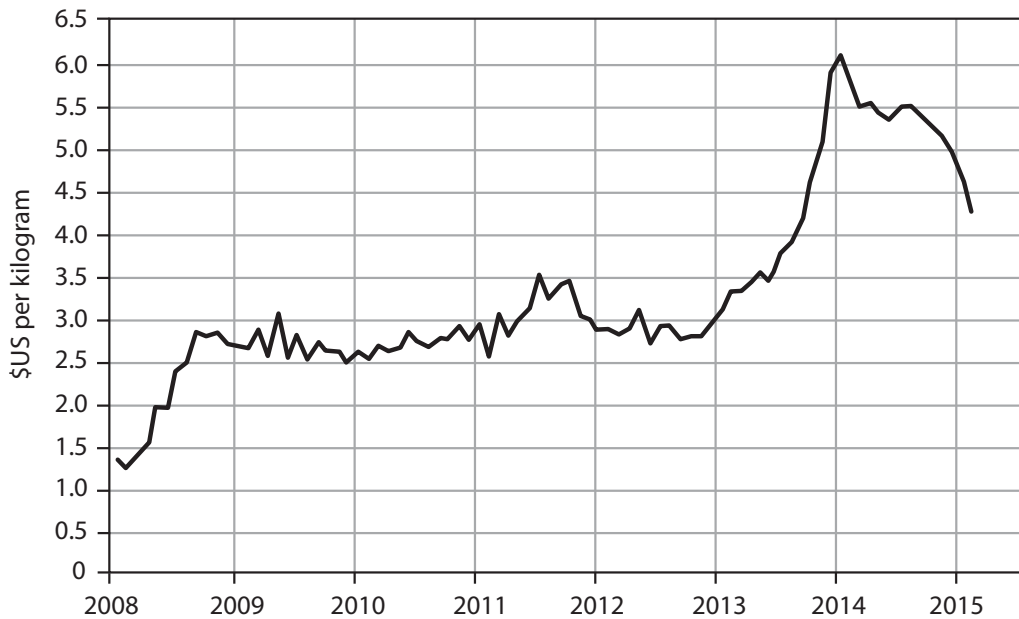
Figure 1 Price of quinoa, $US per kilogram